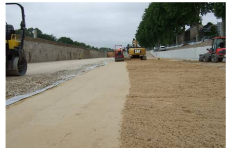
Installation of Trisoplast at the base of the canal.